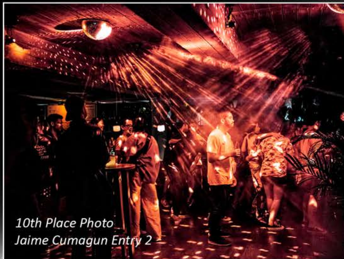
10th Place Photo Jaime Cumagun Entry 2