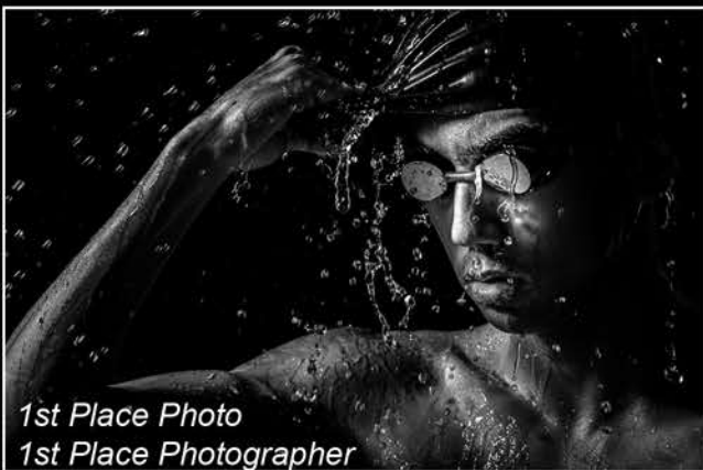
1st Place Photo 1st Place Photographer