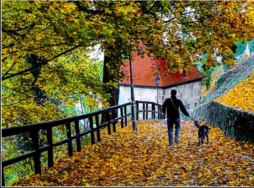
5th Place Photo Chito Viñas Entry 1