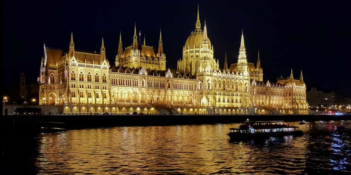
2nd Place Photographer Sison Bob Entry 2