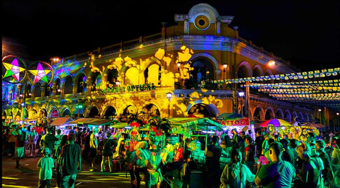
3rd Place Photographer Tony Lilles Entry 1