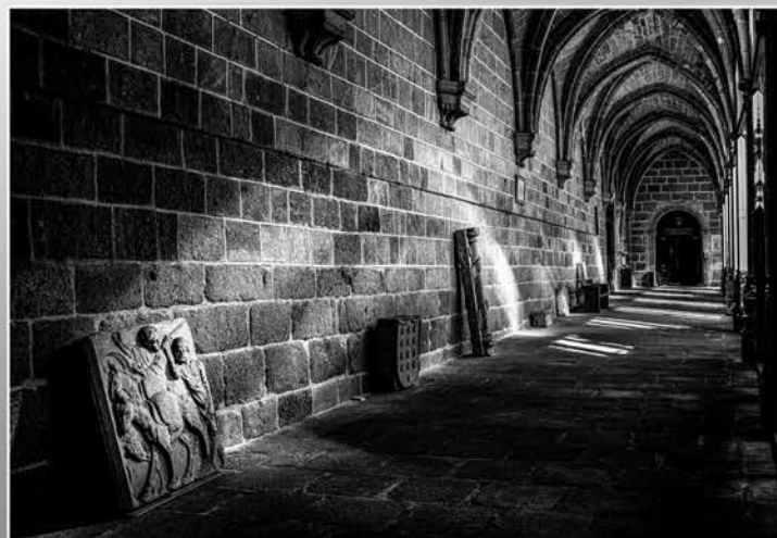
6th Place Photographer

Entry 02 : Antelope Canyon, Page, Arizona