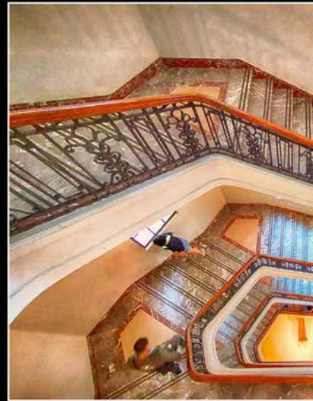
Gino Garbanzos 7th Place Photo Entry 2