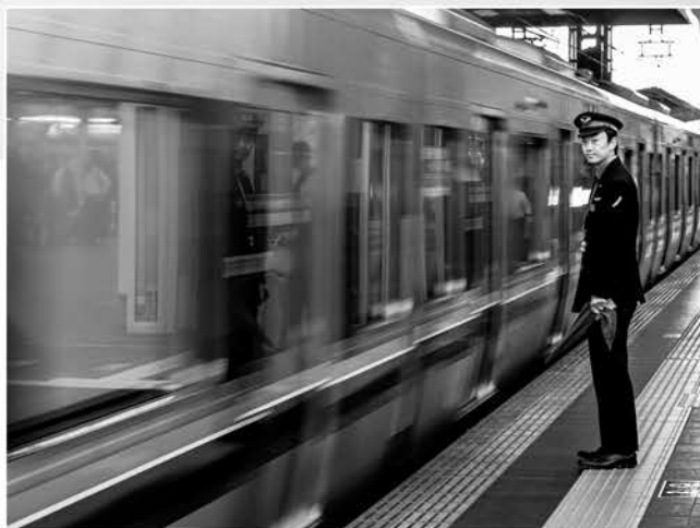
9th Place Entry 33 : Japan