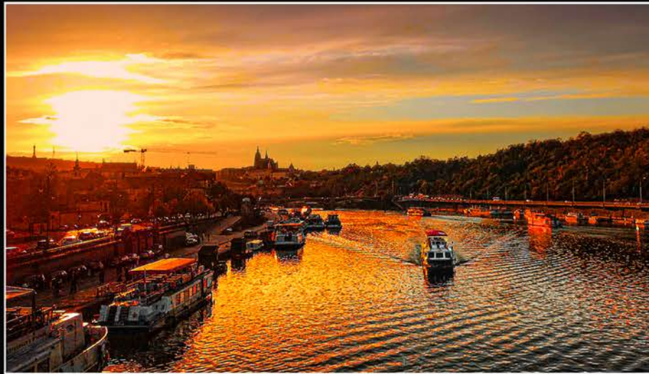
5th Place Photo Chito Viñas Entry 2