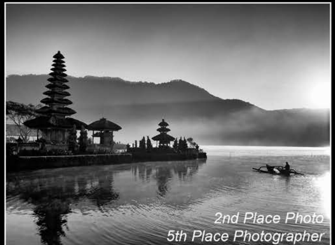
2nd Place Photo 5th Place Photographer