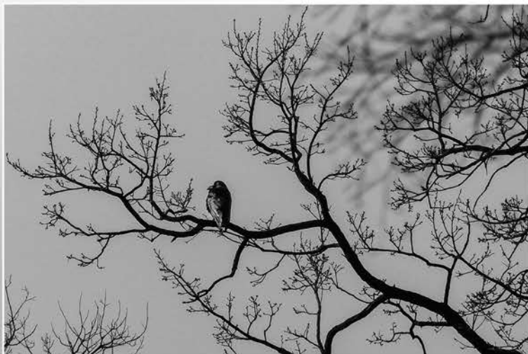
9th Place Photographer Fred Del Rosario Entry 04 : Japan