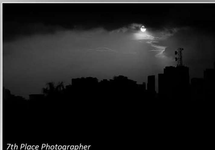
7th Place Photographer