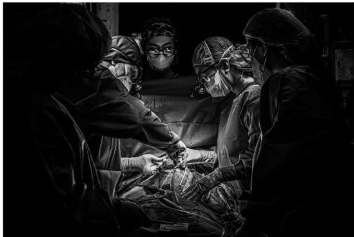
3rd Place Photographer