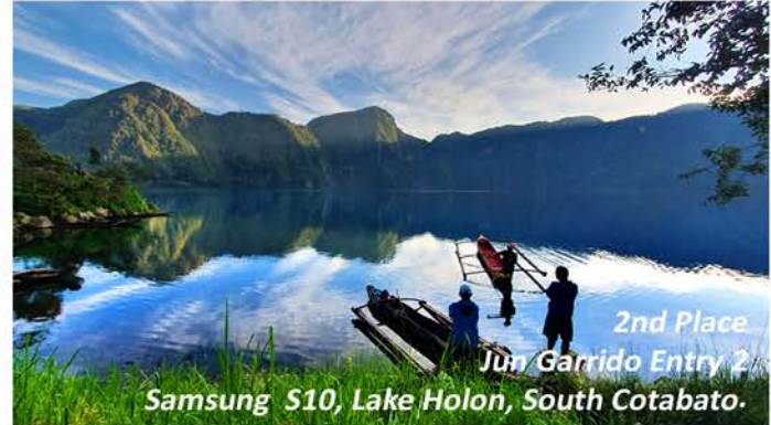
2nd Place Jun Garrido Entry 2 Samsung S10, Lake Holon, South Cotabato.