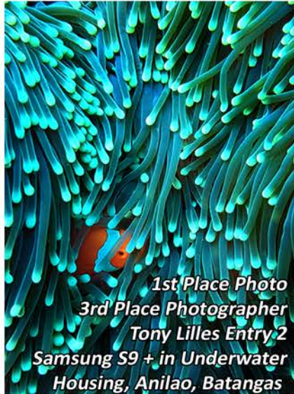
1st Place Photo 3rd Place Photographer Tony Lilles Entry 2 Samsung S9+ in Underwater Housing, Anilao, Batangas

In lieu of the cancelled OTSes this year we embarked on the first competitions held for October, ever. This is usually the month to judge the Pictures of the Year from the past 9 months but due to the ongoing pandemic, all the OTSes were cancelled (and we usually have 4 OTSes per year). Instead, we had not just one but two competitions due to the limited time we had to close the fiscal year and fulfill the usual roster of