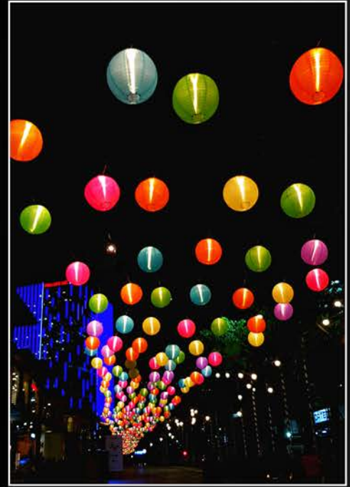
8th Place Photo Manette Benítez Entry 2