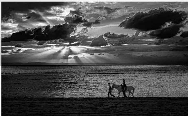
8th Place Photographer Chito Viñas Entry 58 : Balesin Island, Phil.