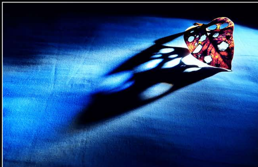
Gino Garbanzos 7th Place Photo Entry 1