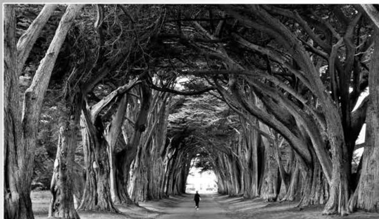
10th Place Entry 24: Point Reyes, California