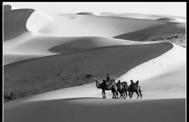
3rd Place Photo 4th Place Photographer Joey Antonio Entry 31 : Sahara Desert