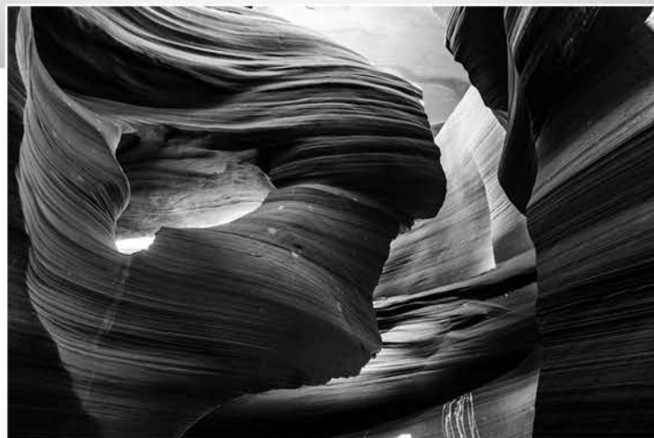
4th Place Photographer