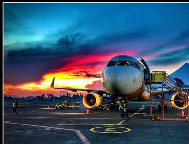
8th Place Photo Adel Samson Entry 1