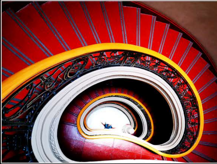
8th Place Photo Manette Benítez Entry 1