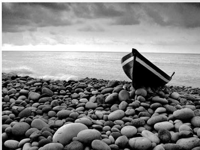
5th Place Photographer