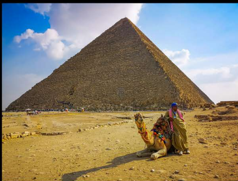
4th Place Entry 2