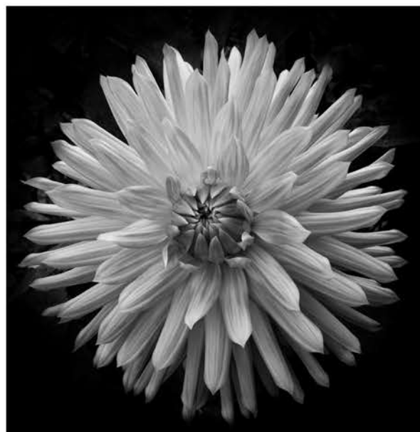
10th Place Entry 53