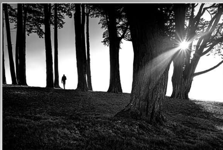
8th Place Photographer