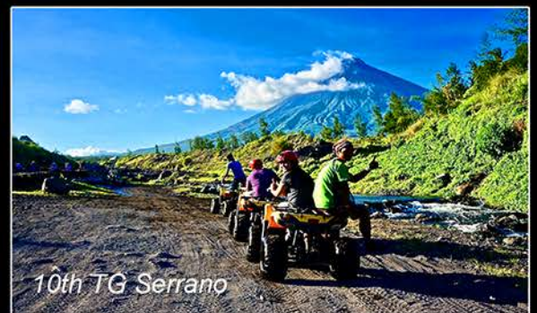
10th TG Serrano