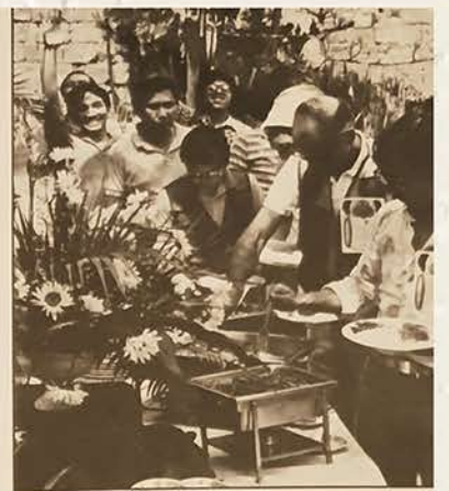
Lunch was hosted by the Intramuros Administration