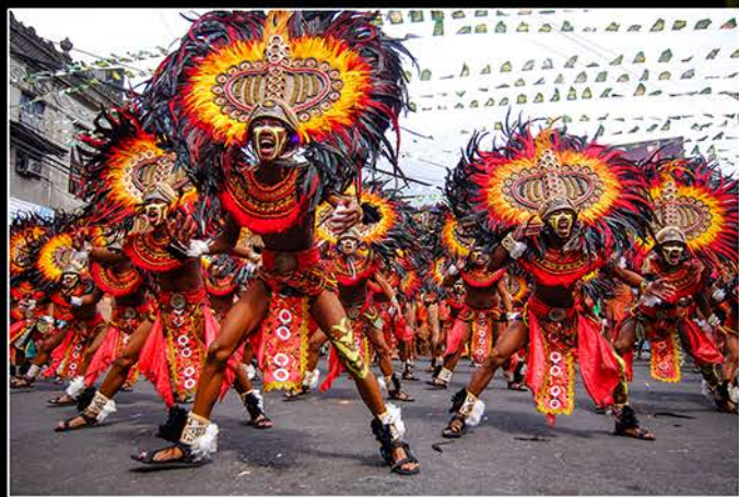
7 th Mesuga, Boyet #2