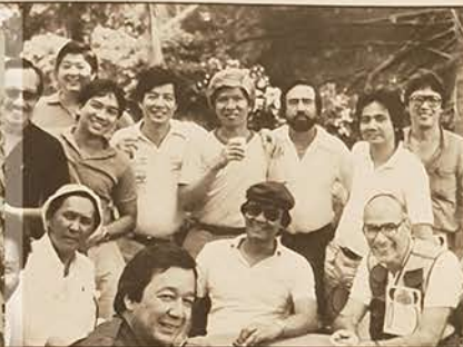
... after a sumptuous dinner to prepare for the afternoon