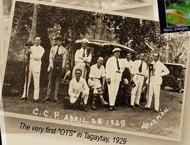
C.C.P. ABRIL 28, 1929 The very first "OTS" in Tagaytay, 1929

Monday of the month at the Intercontinental in Makati At these regular monthly ings, the members socialize old regular monthly photo etitions on themes and media ding to a pre-announced al program. Every year, vers are elected to a Board ectors where the upcoming year's activities projects are planned and approved. Included in the exercise