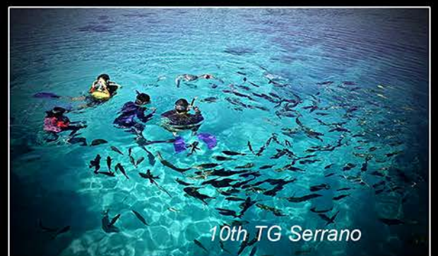
10th TG Serrano