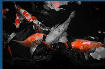
#3 Lagrimas, EJ 1