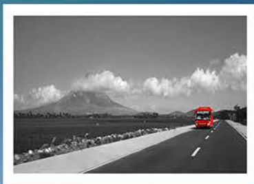
#7 Serrano, TG 1