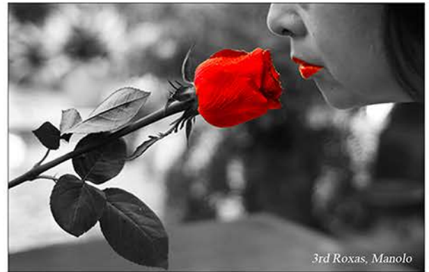
3rd Roxas, Manolo

Stephen Valera's kids in a temple are also in the same color, making Red the dominant favorite while placing 4th in top photo. Only Juni Samson's Yellow-bellied Whistler or Black-naped Oriole bird adds the third highlighted color to make the top 5.