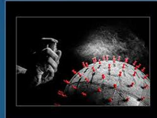
#4 Grabador, Evan 1