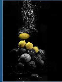
#6 Garrido, Jun 1