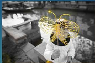
#3 Lagrimas, EJ 2