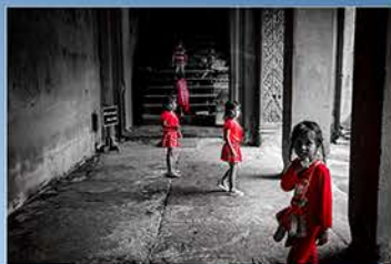
#9 Valera, Stephen 1