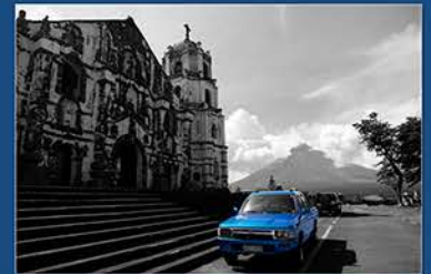
#6 Garrido, Jun 2