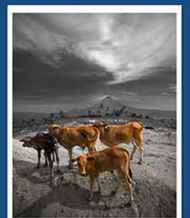
#8 Mesuga, Boyet 2