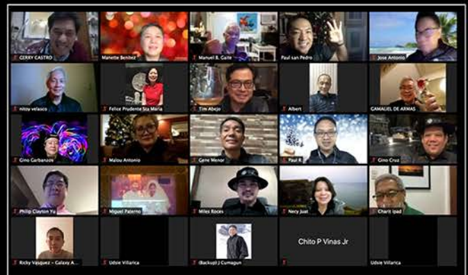
As many as 56+ members attended virtually at zoom while 15 members where in APOSENTO LIVE!