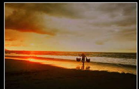
10) Entry #04_de Leon Rudy Entry 1