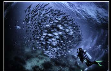
6) Entry #72_Samson Adel Entry 2