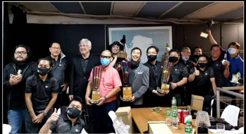
15 magnificent awardees