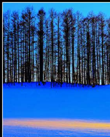
7) Entry #58_Yu Philip Entry 2