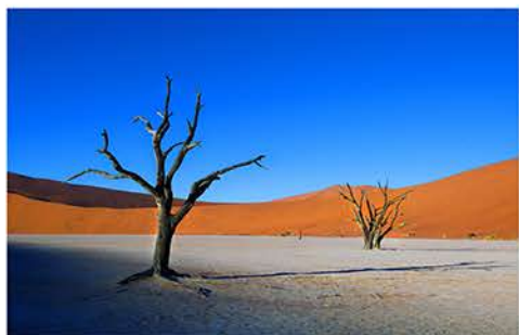
Manolo Roxas # 8