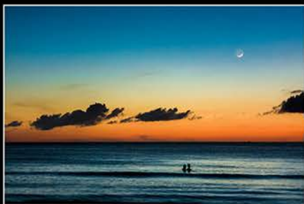
5) Entry #47_Cumagun Jaime Entry 2