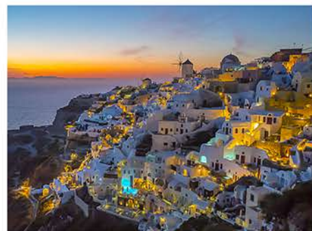
Chito Vinas # 10