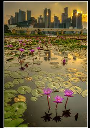
4) Entry #51_Grabador Evan Entry 2