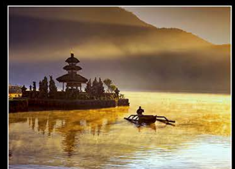
10) Entry #48_de Leon Rudy Entry 2