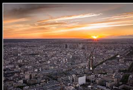
9) Entry #81_Valera Stephen Entry 2