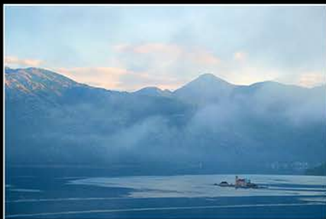
7) Entry #14_Yu Philip Entry 1