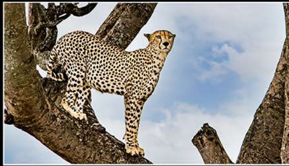
3) Entry #29_Sison Bob Entry 1