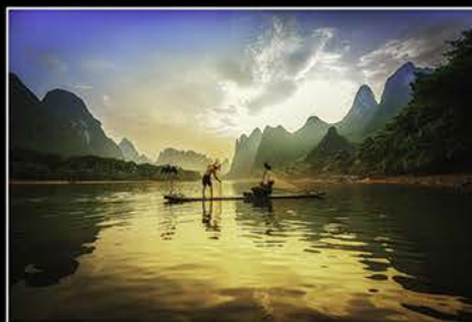
6) Entry #28_Samson Adel Entry 1