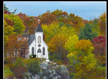
8) Entry #46_Vinas Chito Entry 2