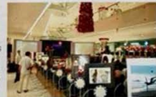
The Best of year 2007 photographs displayed simply and elegantly using actual entries