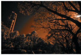
1. Philip Yu: UP OTS