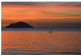
2. Manolo Roxas: EL NIDO OTS