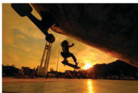
4. Evan Grabador: QC CIRCLE OTS