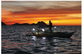
2. Gutch Gutierrez: EL NIDO OTS