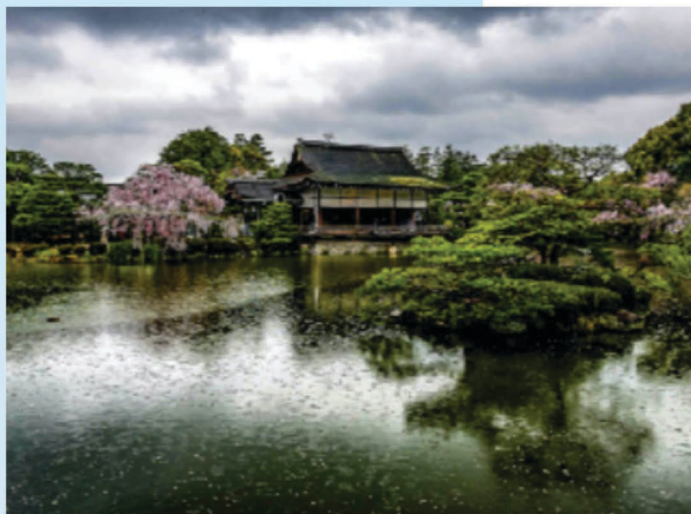
Fred del Rosario: First Place

Just like that, the monthly competitions for 2018 have drawn to a close. Before we hang up our gloves and take a break from photography, at least for the next three months, September demands a review. September was made to accommodate three contests: the last monthly competition where the theme was 'Rain' and two On-the-Spot competitions, one for Bali and the other for the 90 th year anniversary celebration.