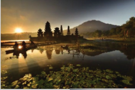
Annabelle Chavez: First Place