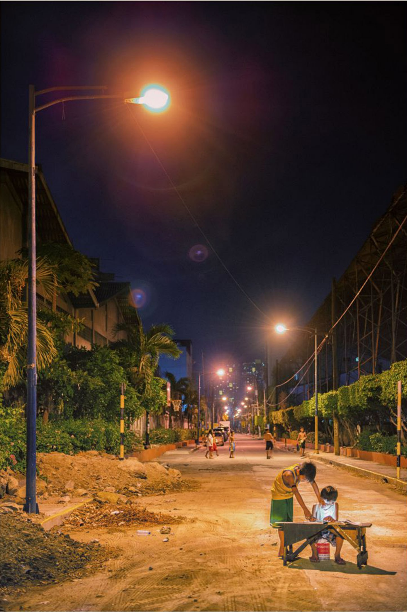
Adel Samson: Third Place

Paine, the centerpiece of the Torres del Paine, a national park in southern Chilean Patagonia. 'Paine' means blue in the native tongue. The photo might have been taken at sunrise, when the sun painted the mountain range with vivid colors of red and orange, while the sky became a melange of blue, orange and violet. It is easy to see why a sight like this would be taken by judges as fitting the theme of ambition, as any photographer worth his salt would want this in