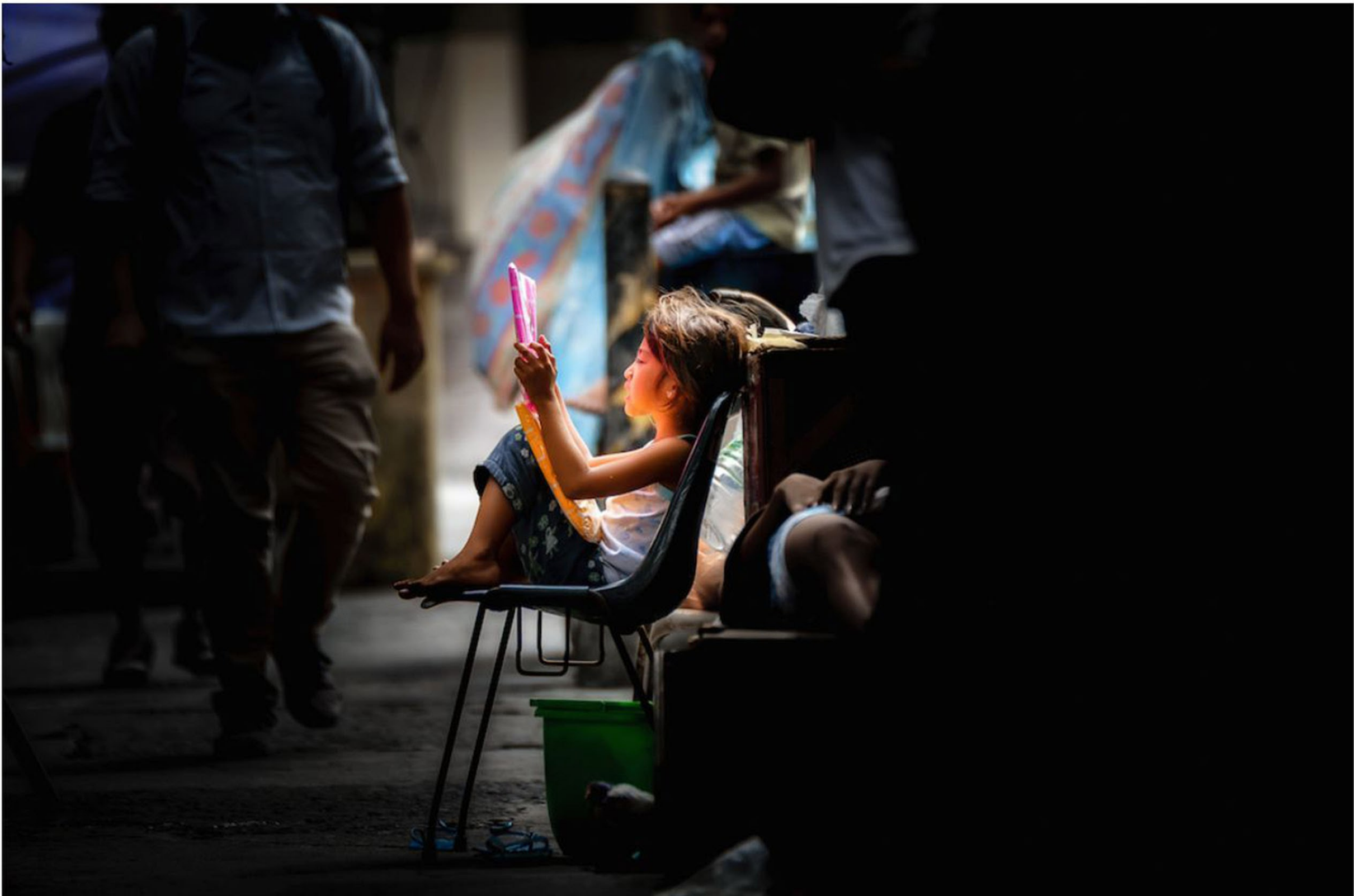
Evan Gabrador: First Place