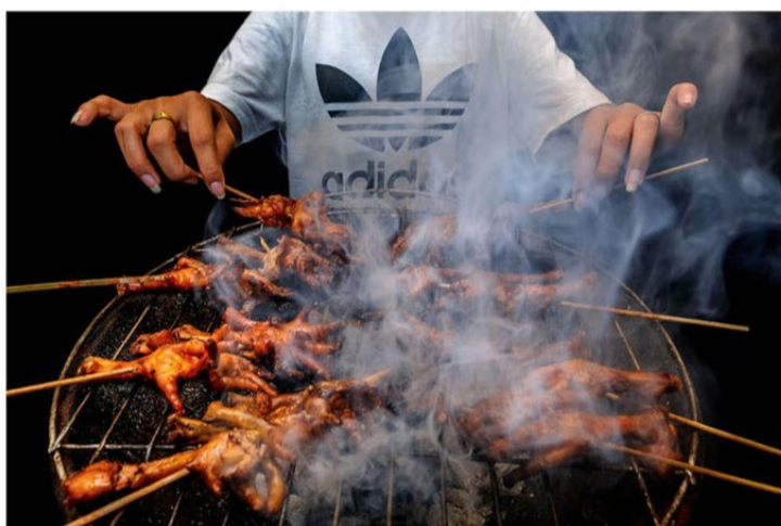
Evan Grabador: First Place

In the street food competition, probee Evan Grabador won the award for First Place for both Top Photograph and Top Photographer for the month of June. For his photo that won first place, Evan submitted a photo of roasting chicken feet shot against a photo of a person wearing a shirt which says Adidas, a cheeky reference to the slang for chicken feet. "The smoke effect, the hand gesture of the vendor, the logo of the shirt and the food are all connected as one," says Evan. Evan's other photo is that of a falafel vendor shot in Jerusalem a day before the