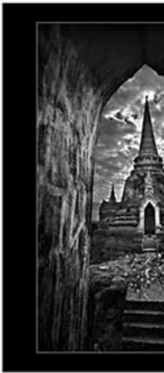
First Place: R