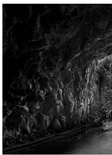
Second Place: Pa