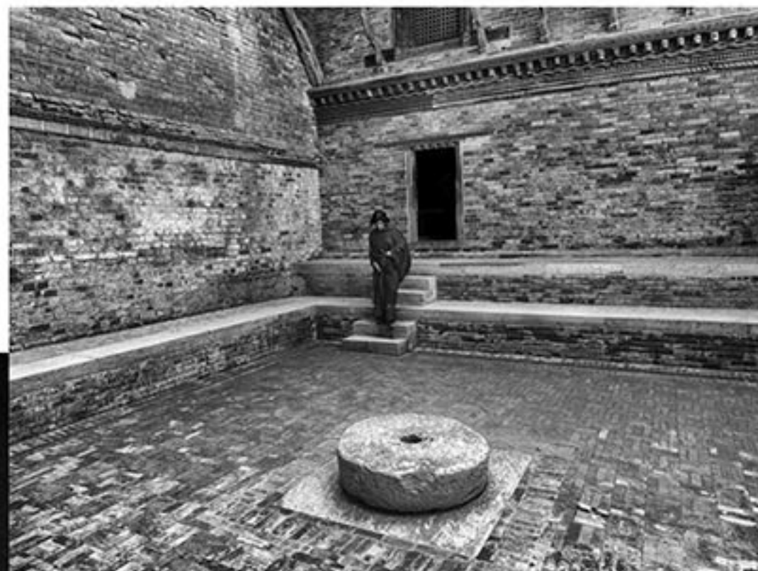
Second Place: Raoul Littaua