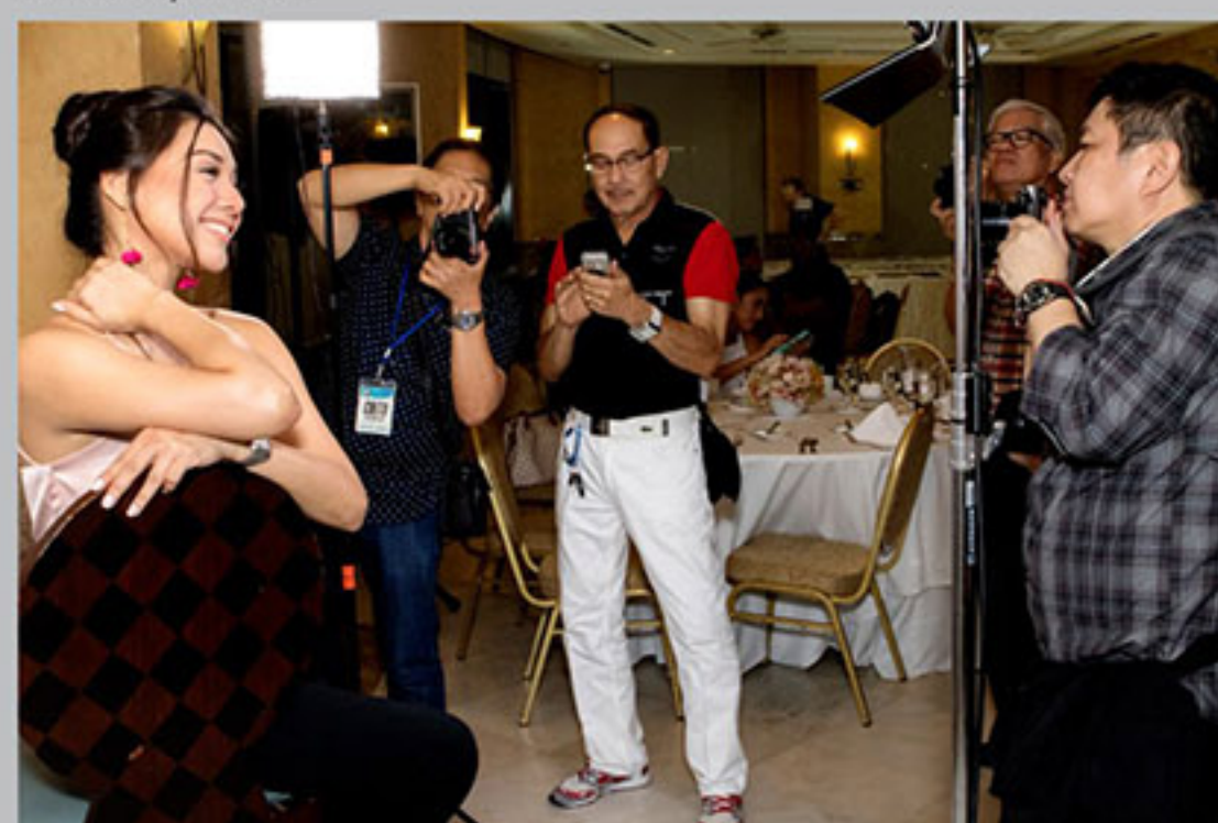
Mutya shoot with CCP members