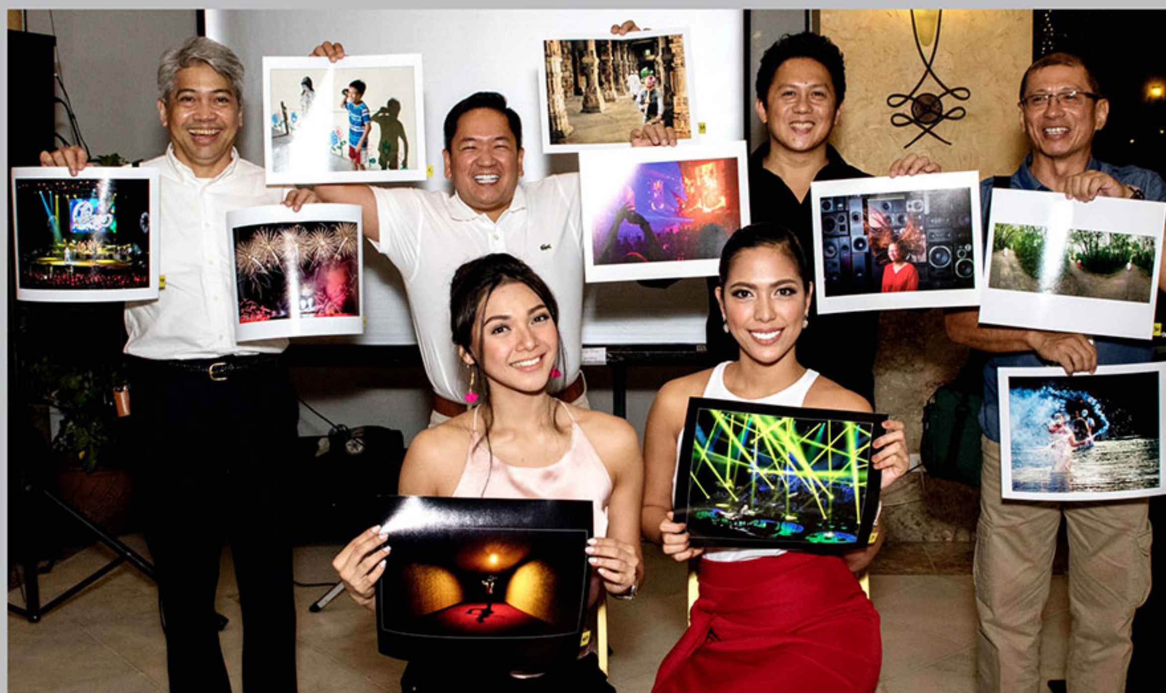
Winners for theme Sound