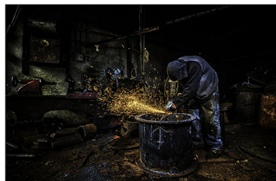
Adel Samson: Second Place