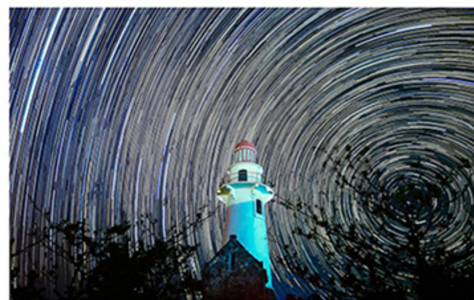
Jijo de Guzman: Third Place