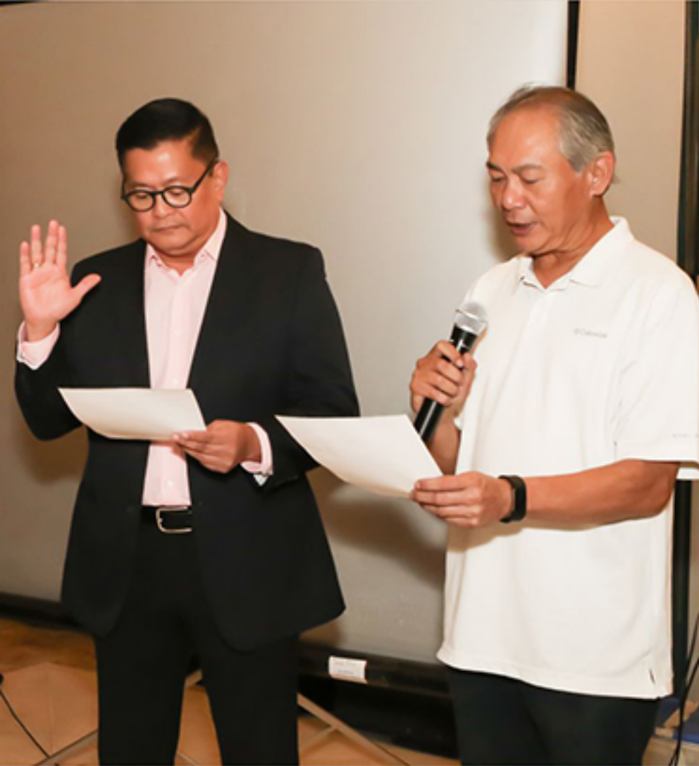
ducted by LM Pancho Escaler