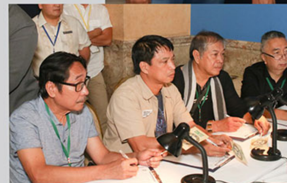
OTS judges seriously viewing all the entries