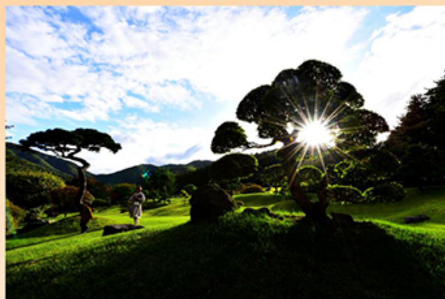
Adel Samson: Second Place