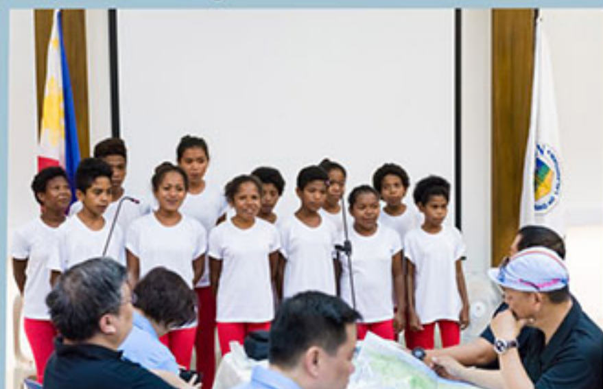
Young Bataan performers sing for CCP guests!