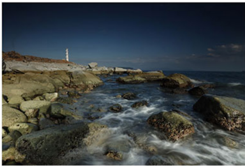
Second Place: Raul Montifar