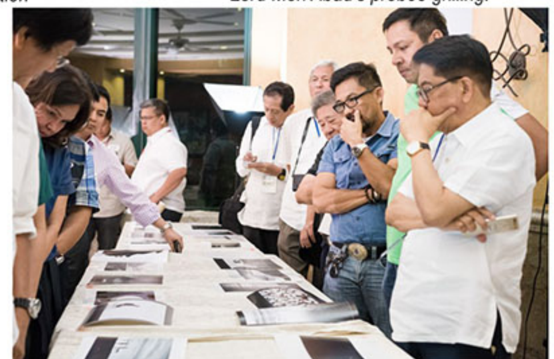
Serious look on members, game face!